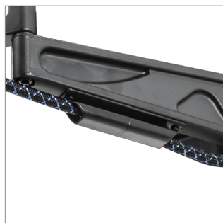
Integrated cable management