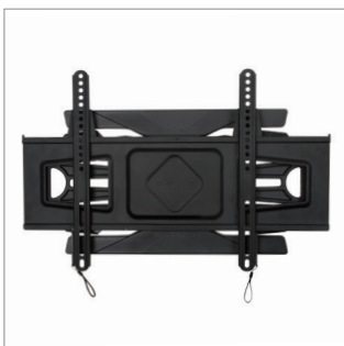
Ultra-slim design mounts screen only 40mm from wall when folded flat