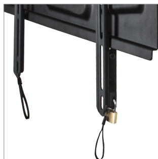
A small padlock can be used to help prevent unauthorised removal of screen