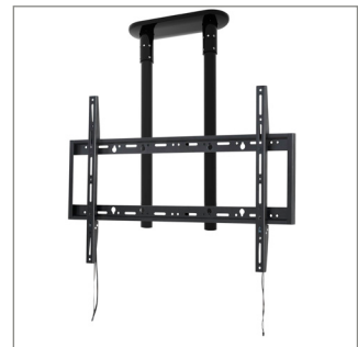
Suitable for pole mounting from ceilings or floors