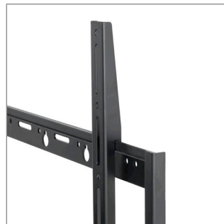
Simple 'Hook-on' installation