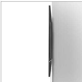
Low profile design mounts the screen 30mm from the wall