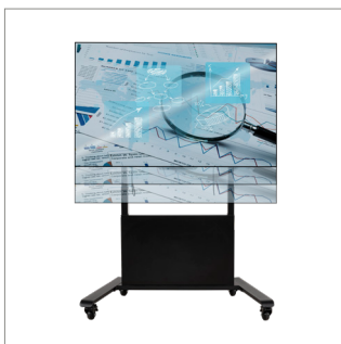
Height adjustment range of up to 650mm