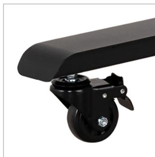
Includes non-marking 3" locking/braked castors