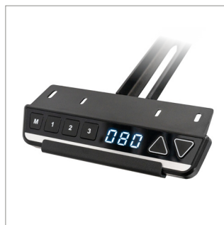
Supplied with a wired control panel