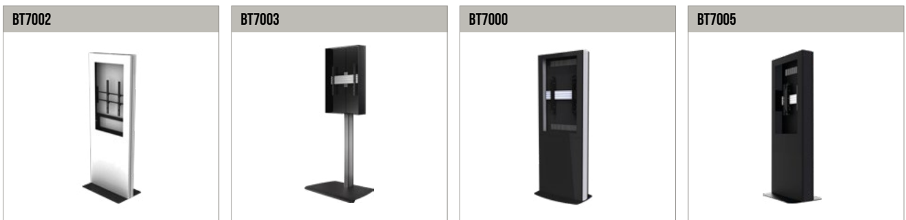
BT7002 Ultra-slim single screen digital signage desk