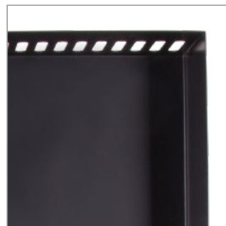
Vented top and bottom panels allow airflow to and from the device