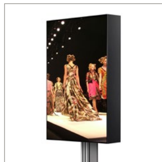
Suitable for portrait mounting