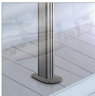
High-end aesthetic quality