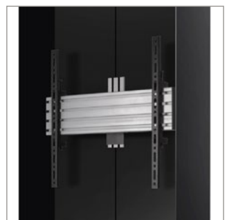
Simple 'hook-on' screen installation