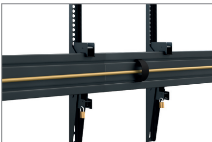
Cable management by cable clips