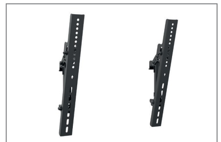
VESA max. 600 x 400 mm