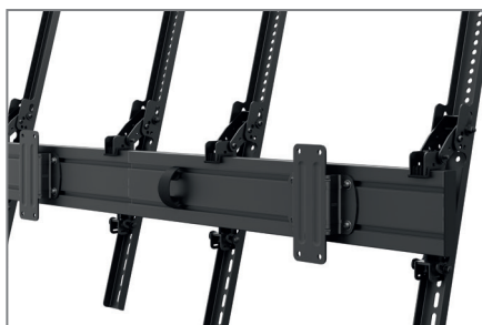
Adaptable thanks to modular design