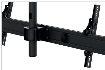
Adaptable thanks to modular design