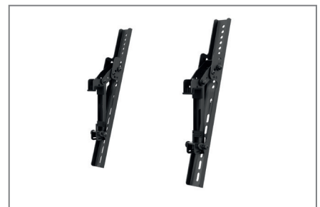
VESA max. 600 x 400 mm