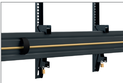
Cable management along the rails by clips