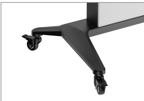
Heavy-duty castors with locking brake