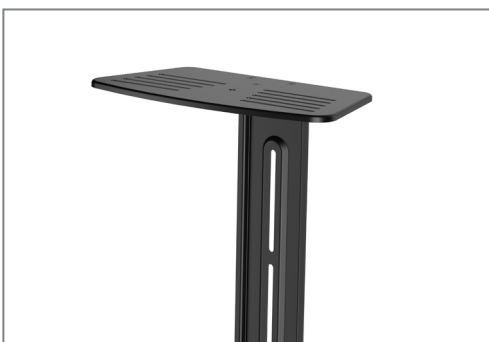
Height-adjustable camera holder included