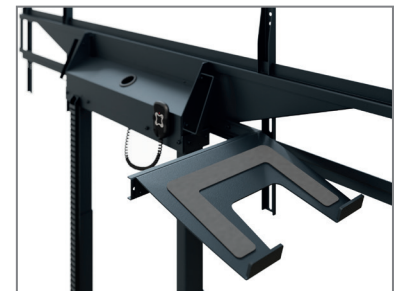
Media cabinet with plug bar and shelf