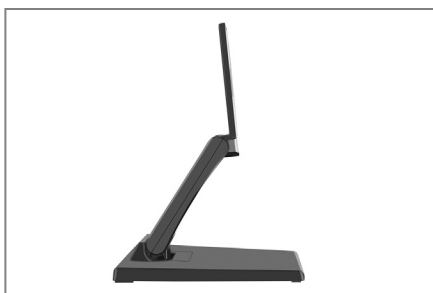
Flexible thanks to two joints