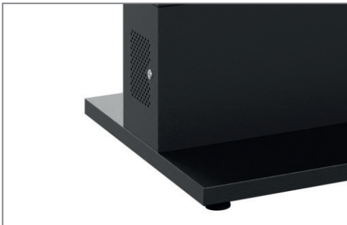
Ventilation openings ensure effective heat dissipation

Additional options also allow the totem to be individually adapted to the desired location.