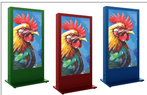
Optionally also in a RAL colour of your choice