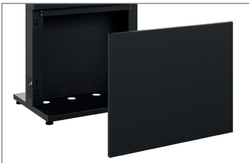
Removable front cover for good service accessibility

Additional options also allow the totem to be individually adapted to the desired location.