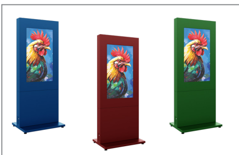
Optionally also in a RAL colour of your choice