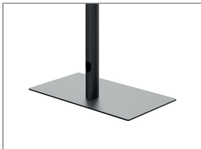
asymmetrical base allows positioning close to a wall