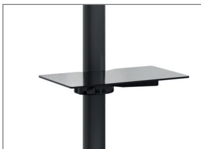
Optional: Braclabs-Stand Front shelf (Item no.: 1984)