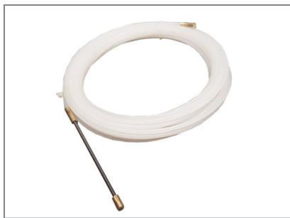
usefull cable pulling aid included

A mobile version (Item no.: 1983) and a version for floor-mounting (Item no.: 1982) is also available.