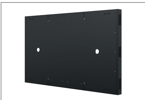
Optional Back Cover available