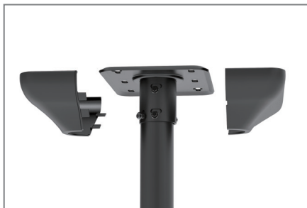
cover for the ceiling screw connection