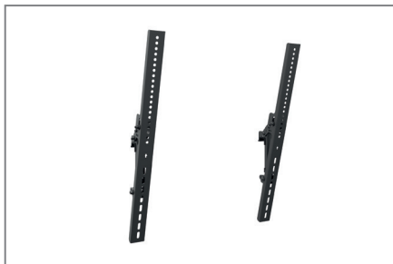
-5° / +15° tiltable