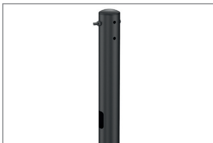
internal cable routeing