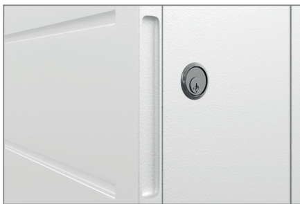
Retractable security lock

Other colour or decor variants (corpus) are available on request - also as unique piece.