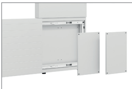
Easy assembly thanks to AV mounting panel (2 pcs)