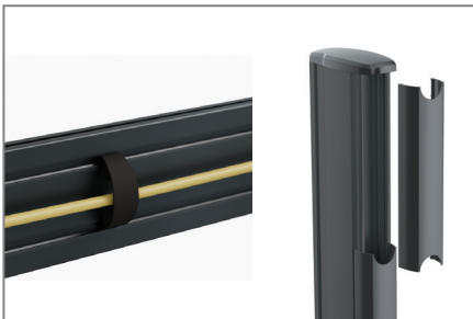
Cable management along the rails / pillars

The complete solutions can be combined and extended with the components of the comPROnents ® series without restriction and thus offer further application possibilities.