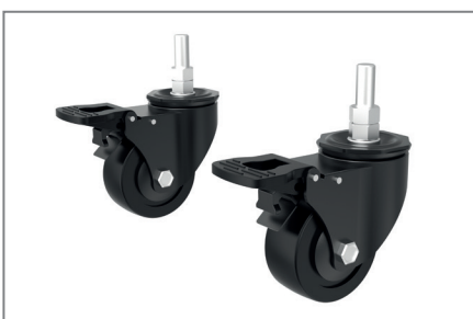
castors with locking brakes