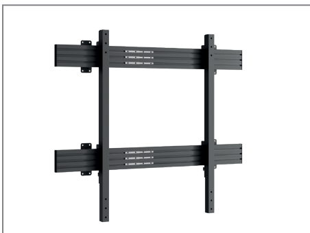
An adapter is required for portrait installation - VESA adapter 800 900 1000 | Item no.: 5083