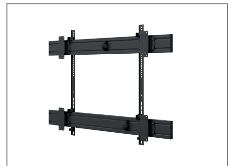
Adaptable thanks to modular design