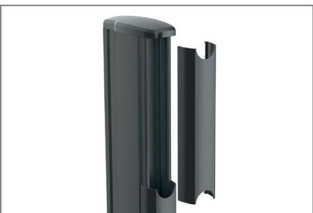
Cable management along the pillars