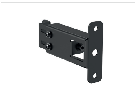
Wall distance variable adjustable