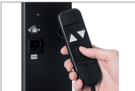
Remote control for height adjustment