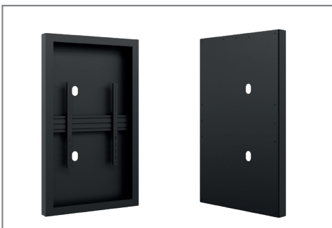
Optional Back Cover available