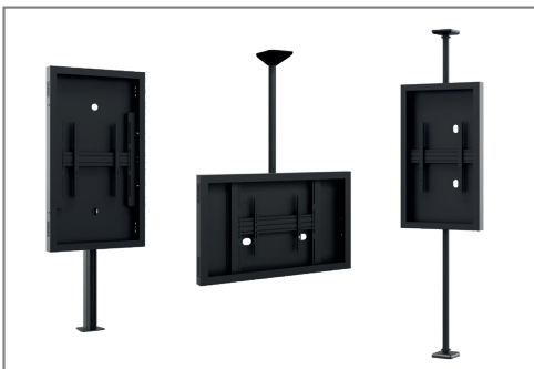
Can be combined with CPS components