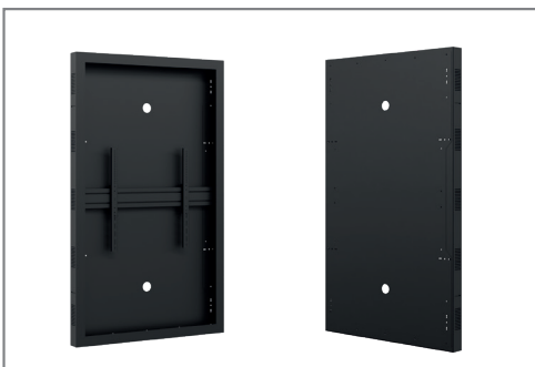
Optional Back Cover available