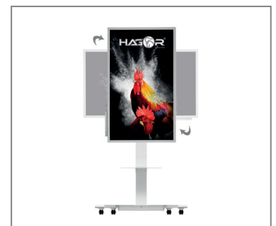
change the format without unlocking