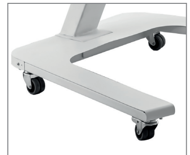
incl. castor set, partially lockable