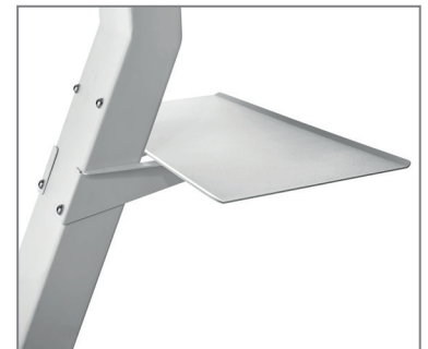
incl. shelf, optionally usable