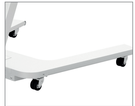
incl. castor set, partially lockable