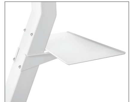
incl. shelf, optionally usable